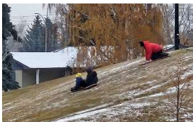
The first skiff of snow on Nov 2 nd brought out the sleds!

Memberships are available at the rink – Family $20 * Single Adult $10 * Seniors $10