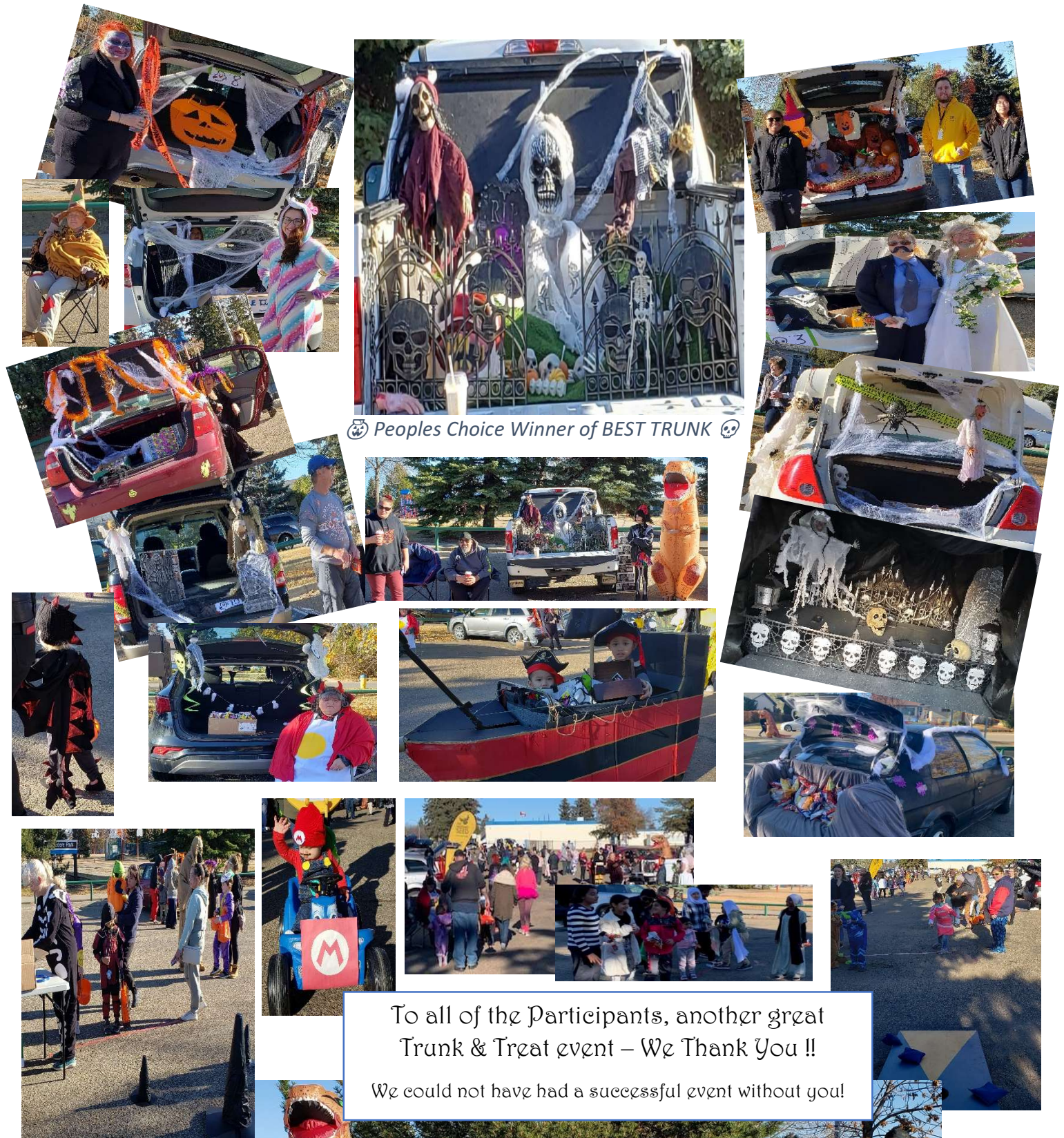
👻 Peoples Choice Winner of BEST TRUNK 🧛

With Thanks to Balwin & Belvedere Revitalization for contributions towards our Trunk & Treat event